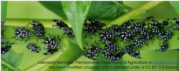
Spotted lanternfly nymphs, present in spring and summer months.