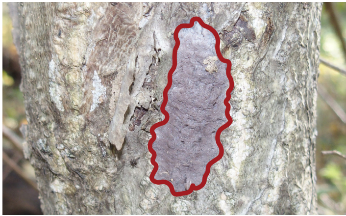
Spotted lanternfly egg mass (outlined in red). Egg masses are present in autumn and winter months, blending in with their surroundings.

By signing this checklist, I am confirming that I have inspected my vehicle and those items I am moving from the Spotted Lanternfly quarantine area, and do not see any egg masses or insects in or on anything I am moving.