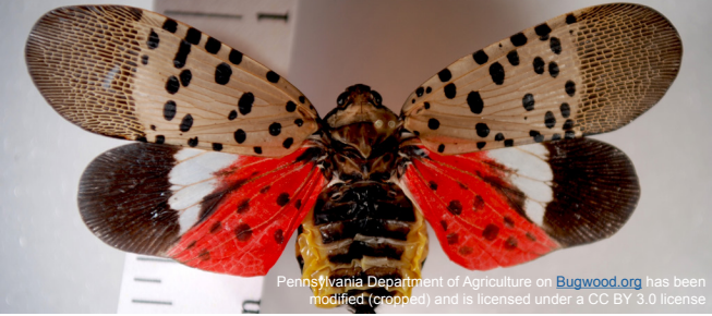
Adult spotted lanternfly, present in autumn months.